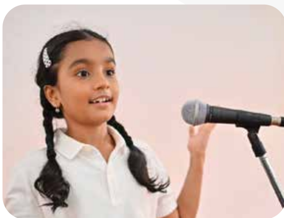
ELGA English Language and General Awareness

ELGA Focus on Speaking Expression and Listening Comprehension