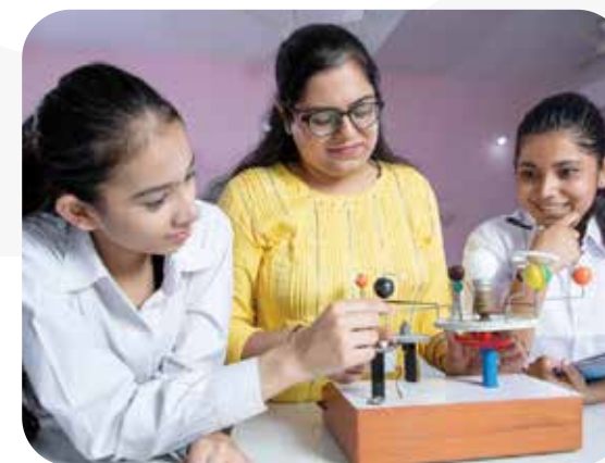
Student-Led Conference Students Act as Teachers

LEAD Championship enables students to display their talent and demonstrate their knowledge & skills thereby winning exciting prizes.